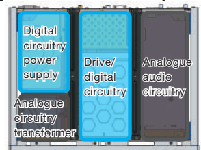
Transport On (Digital only)

The function completely turns off the analogue audio circuitry from power supply to output, by cutting the power supply to the transformer during HDMI connection. The HDMI's S/N ratio further improves and realises high-quality audio and video playback.